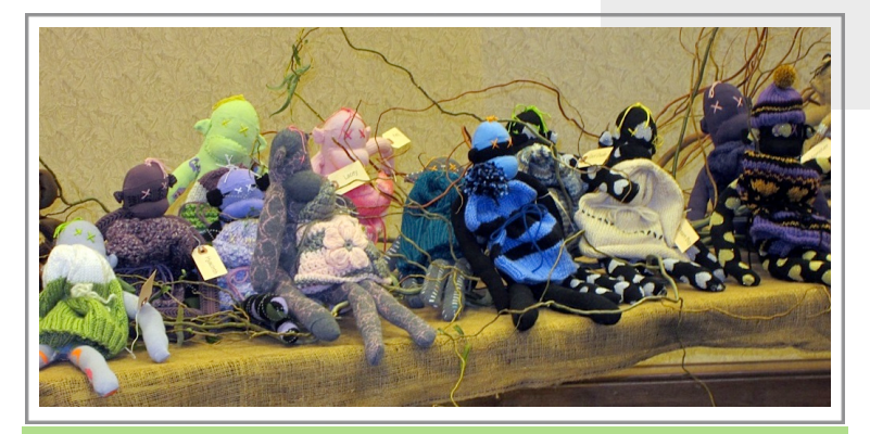
Sock monkeys, paired with matching hats, eagerly await delivery to children in treatment.